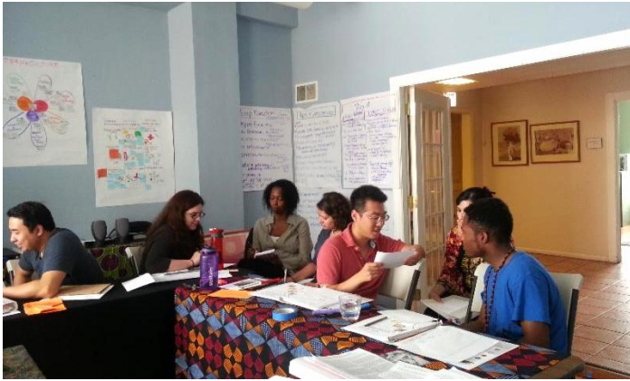
Students and staff using ICA methods to plan for the Solar Unveiling

This year marks the fourth consecutive summer ICA has hosted a program aimed to immerse university students in the arena of sustainable community development.