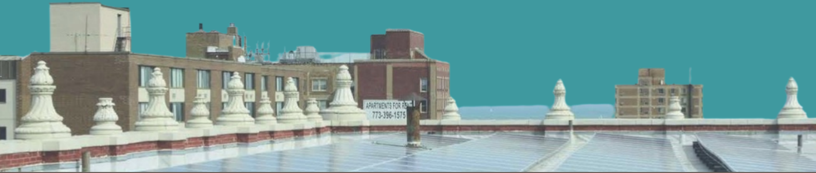
ICA GreenRise has 483 solar panels, providing 25% of the building's electricity; some panels pictured here.

Jay Inslee, Governor, State of Washington