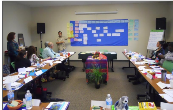
Workshop Method Training