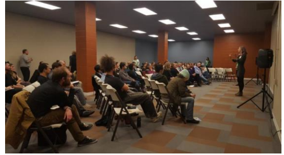
Age of Consequences Screening

ICA is a long-time partner of OEFF and is hosting two films during the 2017 festival. The Age of Consequences screened on Saturday, March 4th and drew 93 participants. The Sonic Sea is screening tomorrow Thursday, March 9th at 7pm . Both films include a post-film discussion with the filmmakers and local resource people taking action related to the film's message. The Sonic Sea screening will also include a special virtual reality experience, Valen's Reef, that takes viewers on a 10 minute tour of a coral reef in Raja Ampat.