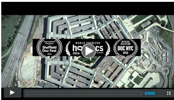
The Age of Consequences Trailer

The screenings are free with a suggested $6 donation. Registration is recommended, but not required, as the screenings are likely to sell out! Reserve your tickets for Sonic Sea!